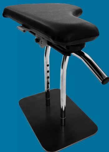
1/2 Support Tray VPL501L (left) VPL502R (right)