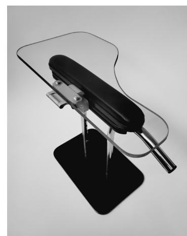
Custom 1/2 Tray