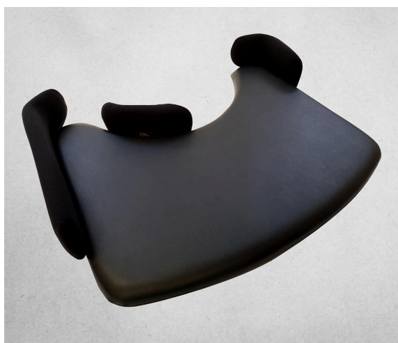
FULL TRAY W ACCESSORIES